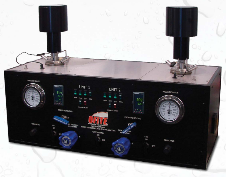
Two SGSM Units on a 20,000 PSI Dual Cell UCA

The Static Gel Strength Measurement (SGSM) device uses a vaned bob to condition a cement slurry inside a pressurized test cell and intermittently measure static gel strength at down-hole conditions. By directly measuring the forces required to initiate movement in the sample, the SGSM provides an accurate way of determining the static gel strength.