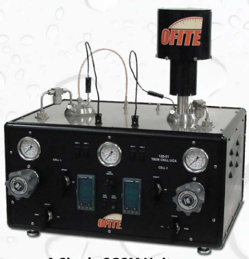
A Single SGSM Unit on a 5,000 PSI Twin Cell UCA