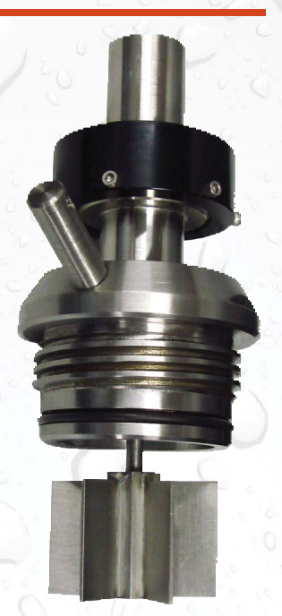
SGSM Cell Cap Assembly